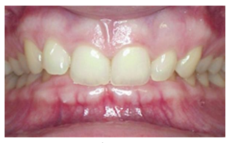
Figure 1: Deep Bite

There are so many treatment techniques for deep bite correction that have important role in oral function and facial appearance .4